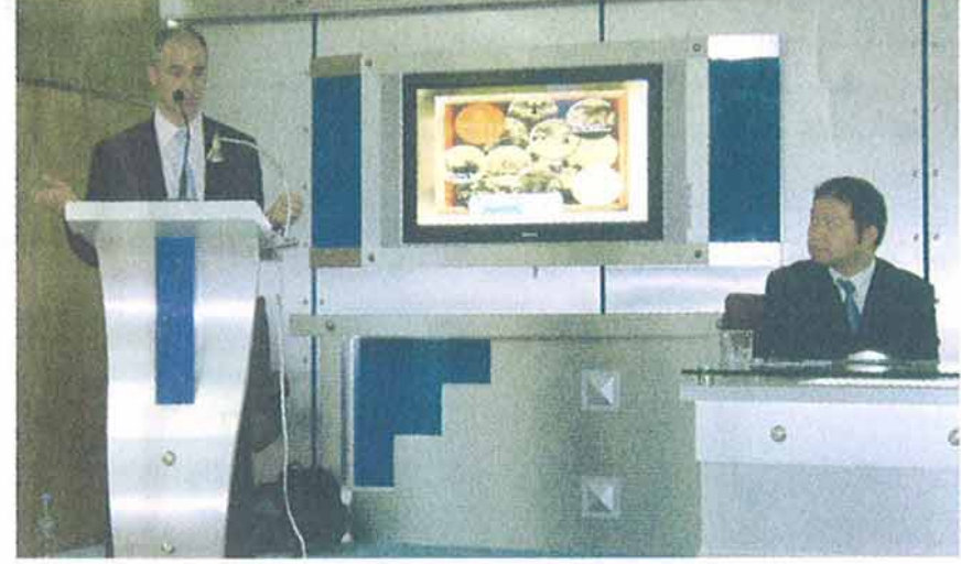
■ من المحاضرة

السرد في الثقافة اليابانية بصورة أكثر وضوحا من خلال بعض التفاصيل بشئى جوانبها بالإضافة لرؤية شاملة عن أهم خطوات ومراحل تطور السينما اليابانية الأولى و مسيرتها عبر التاريخ و الشخصيات التي أثرت بها . جاء تنظيم المحاضرة استكمالا لنشاط تفعيل العلاقات الثنائية ما بين اليابان و السلطنة عبر عدة نواح كالحوار الفكري و التبادل الثقافي و غيرها لضمان استمرارية جوانب التبادل الثقافي بين البلدين .