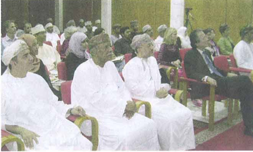
■ جانب من الحضور

السرد في الثقافة اليابانية بصورة أكثر وضوحا من خلال بعض التفاصيل بشئى جوانبها بالإضافة لرؤية شاملة عن أهم خطوات ومراحل تطور السينما اليابانية الأولى و مسيرتها عبر التاريخ و الشخصيات التي أثرت بها . جاء تنظيم المحاضرة استكمالا لنشاط تفعيل العلاقات الثنائية ما بين اليابان و السلطنة عبر عدة نواح كالحوار الفكري و التبادل الثقافي و غيرها لضمان استمرارية جوانب التبادل الثقافي بين البلدين .